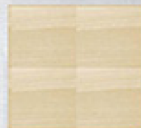
BOUNCE 2 WHEAT