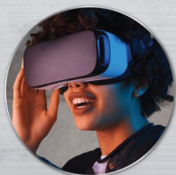
VIRTUAL REALITY (VR)