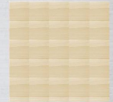
BOUNCE 2 WHEAT